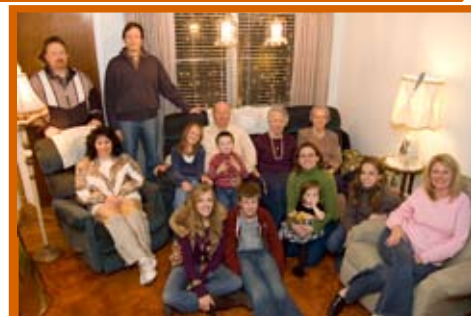
Taken one year ago. One son and foster girls and their families are missing. Can't get everyone together at once!